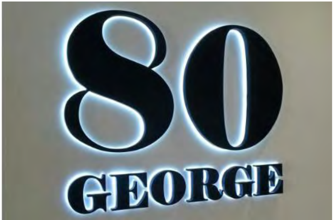
Fabricated backlit letters