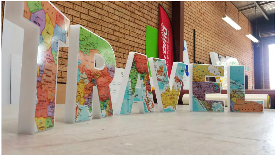
Solid acrylic cut-out letters