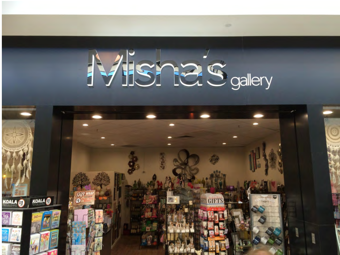
Illuminated acrylic fabricated letters