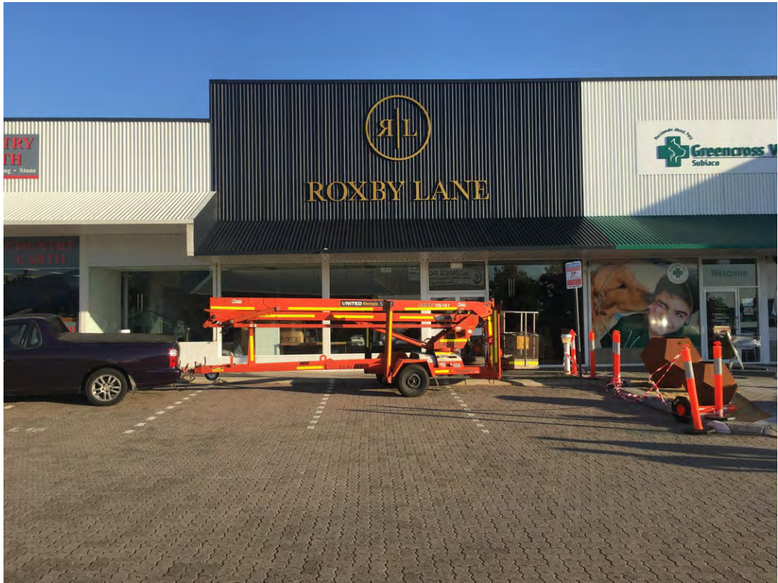
Fabricated letters, 2pac painting processing