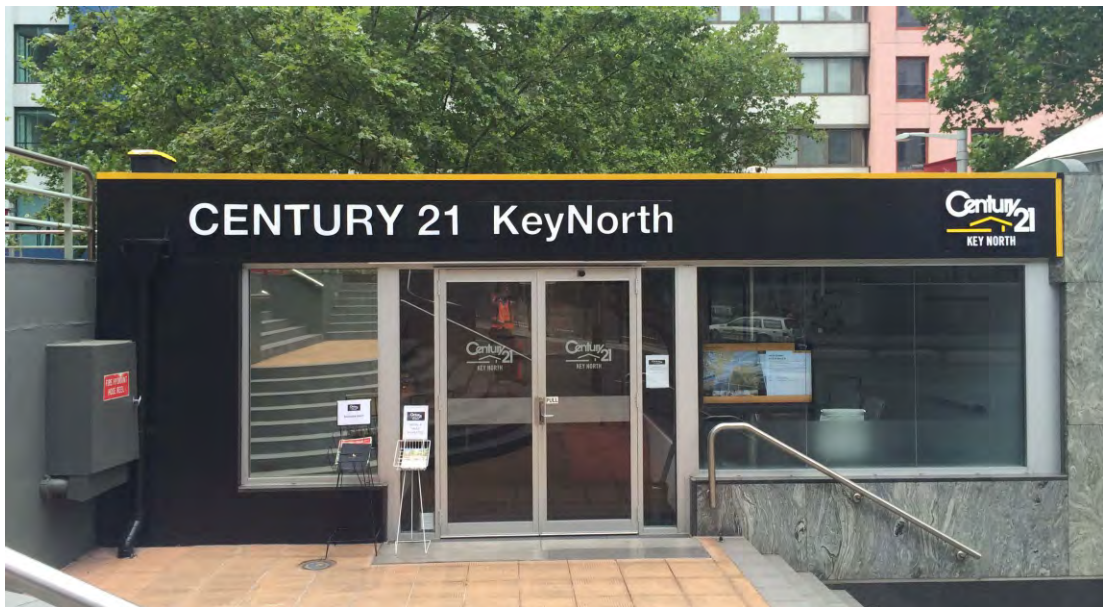
Fabricated front-lit letters