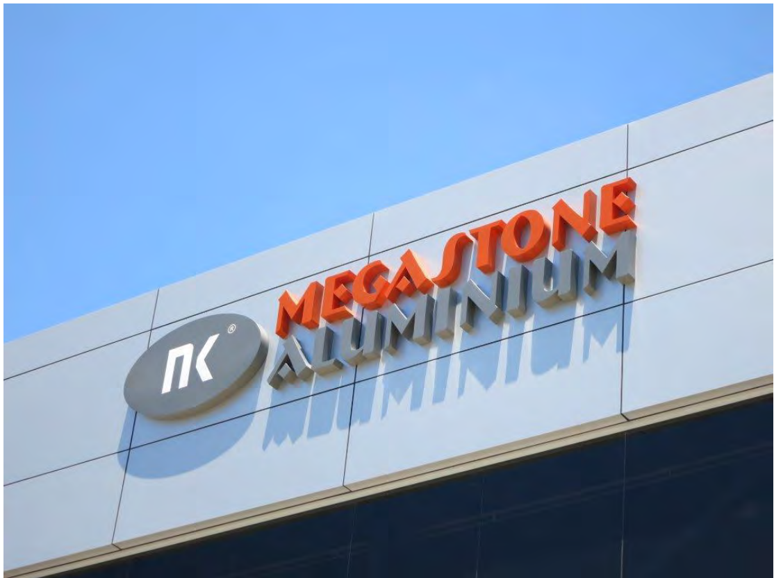
Fabricated stainless steel letters