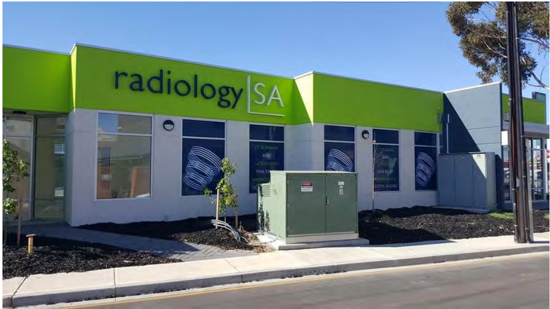
Fabricated stainless steel letters