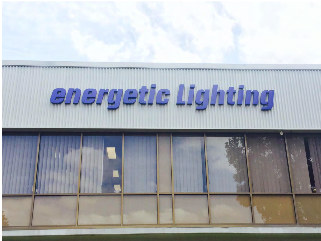
Fabricated letters, 2pac painting processing