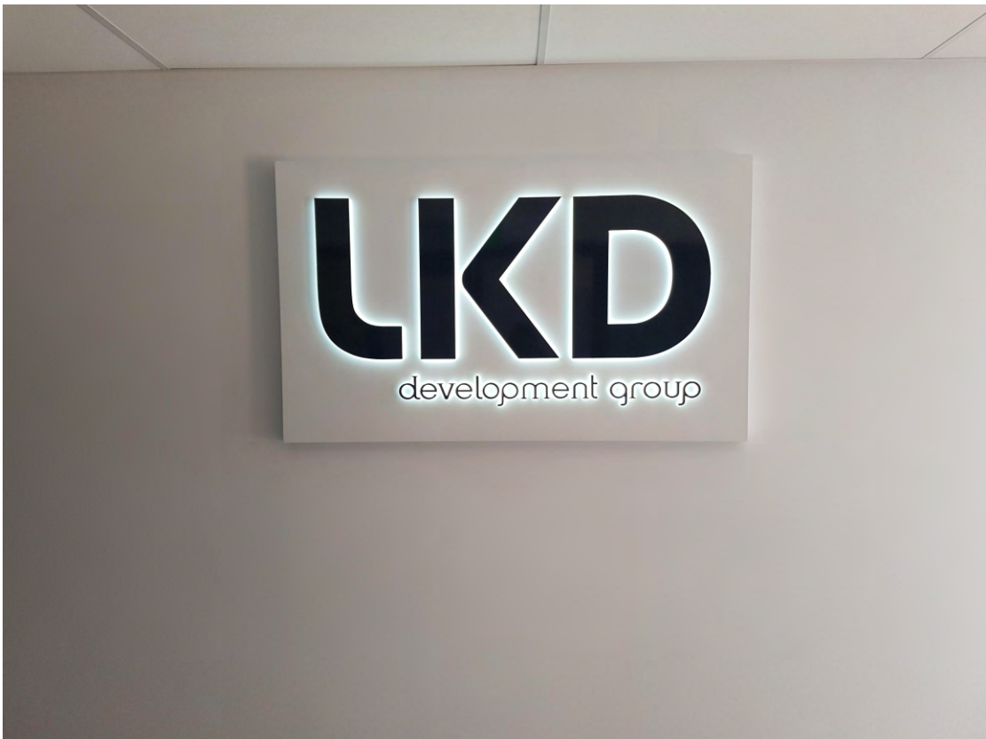
Light box with put through acrylic letters