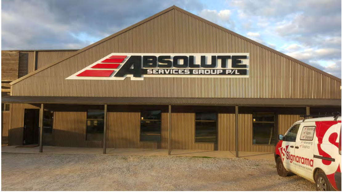
Backlit stainless steel fabricated letters