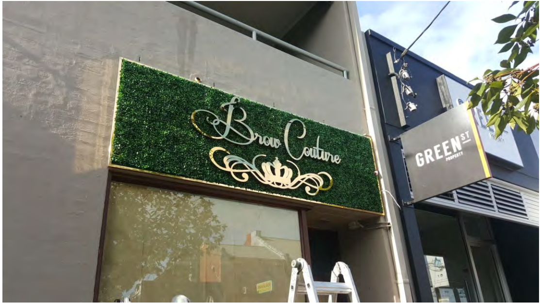
Backlit letters, gold electroplated face & return