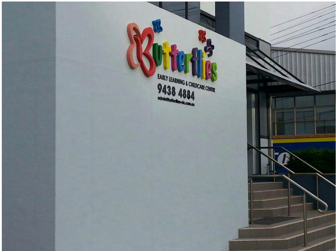
2pac painted metal letters