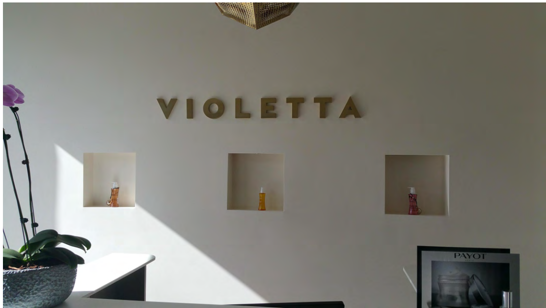
Gold electroplated letters