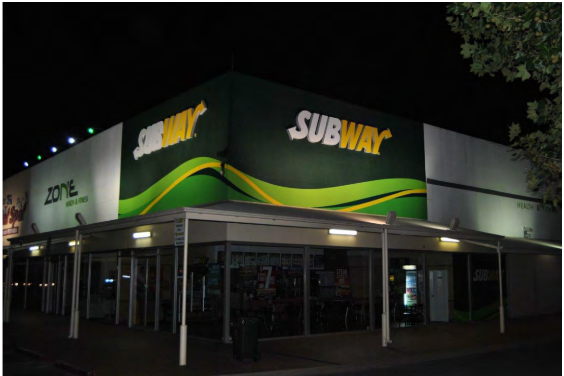
Acrylic fabricated letters