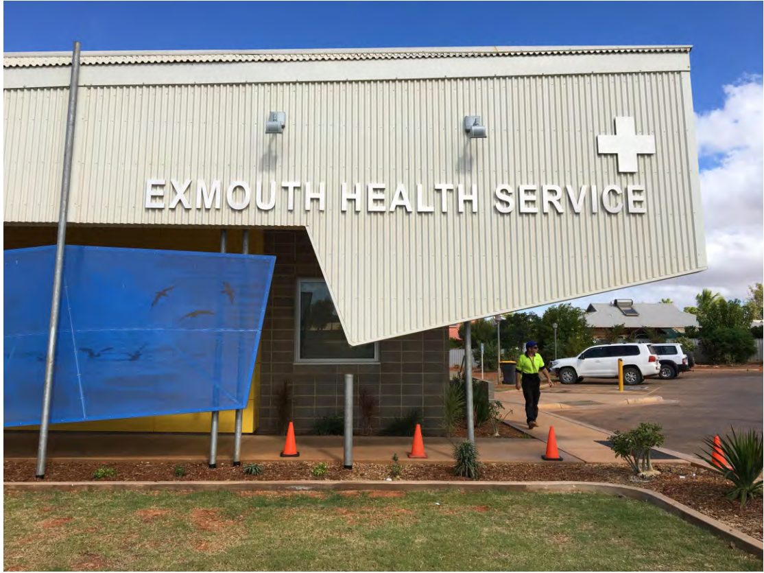
316 stainless steel letters