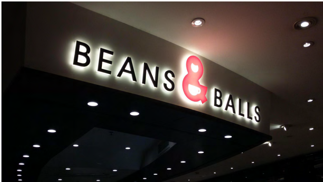
Illuminated 30mm thick acrylic cut-out letters