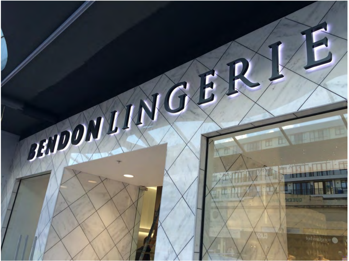
Back Lit Acrylic