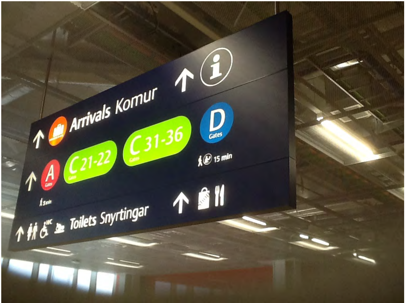
I-Display 50mm Double side Light Box