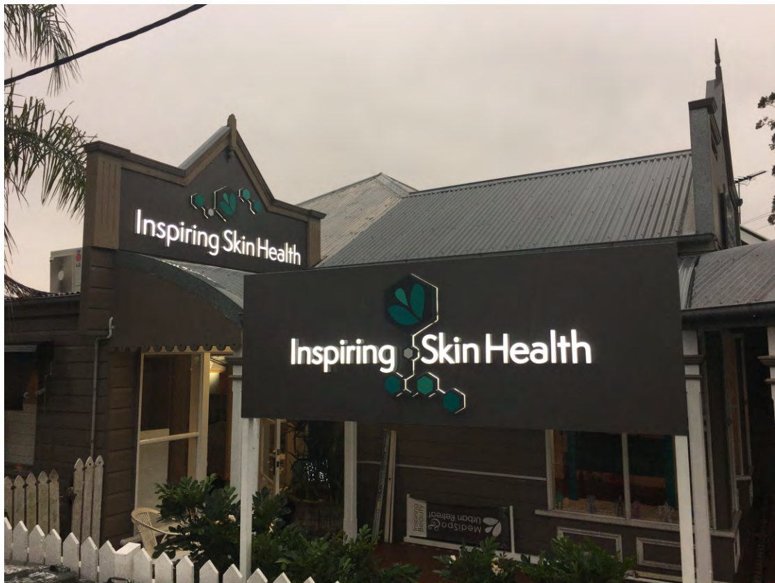
Front-lit fabricated letters