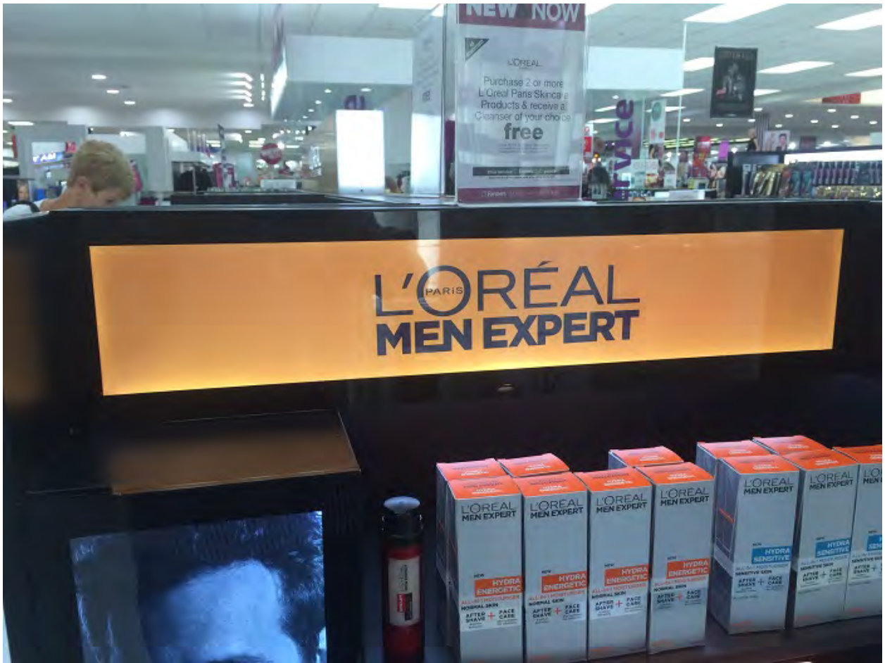
Slim Line Magnetic Face Light Boxes For Display Counters