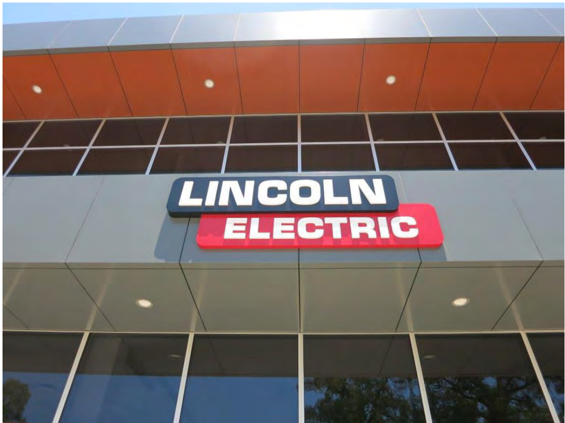
Fabricated stainless steel letters