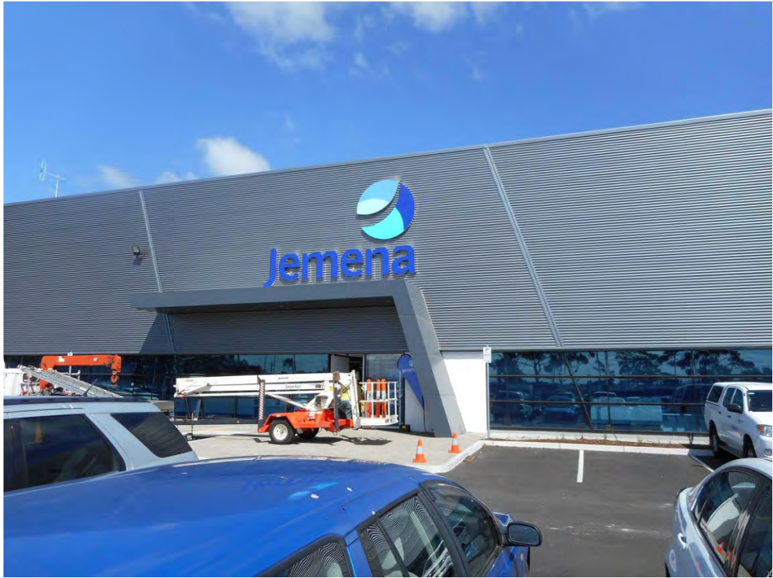
Fabricated stainless steel letters