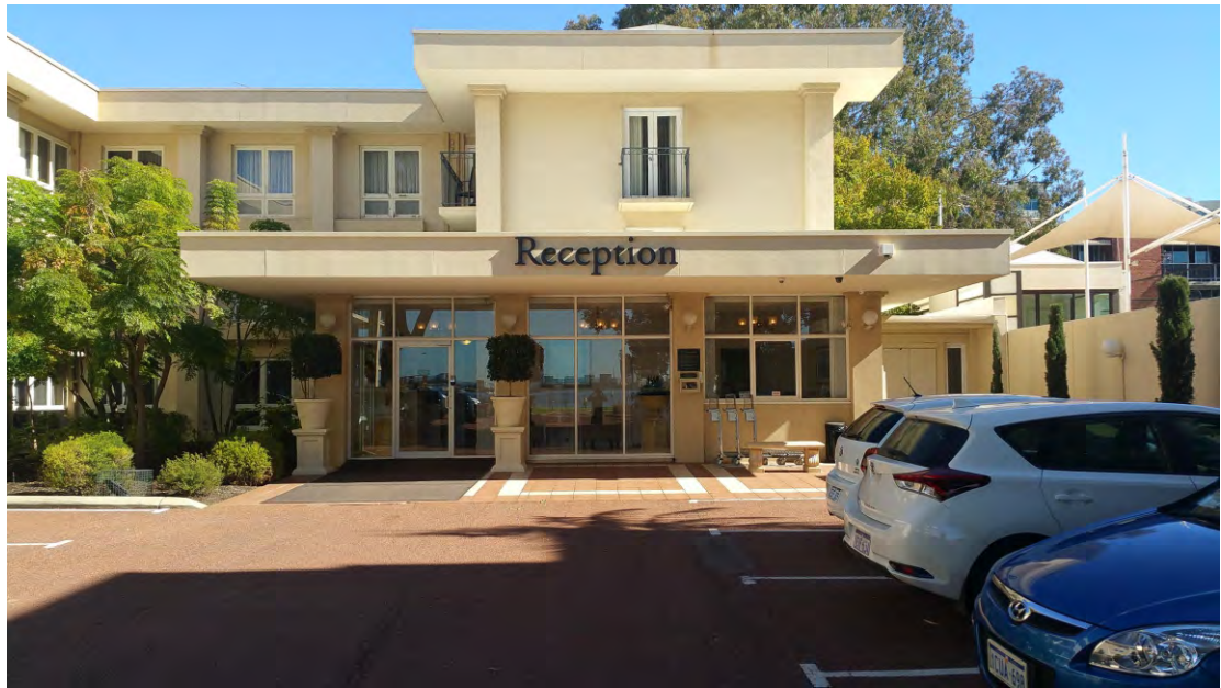
Front-lit letter with black/white acrylic face