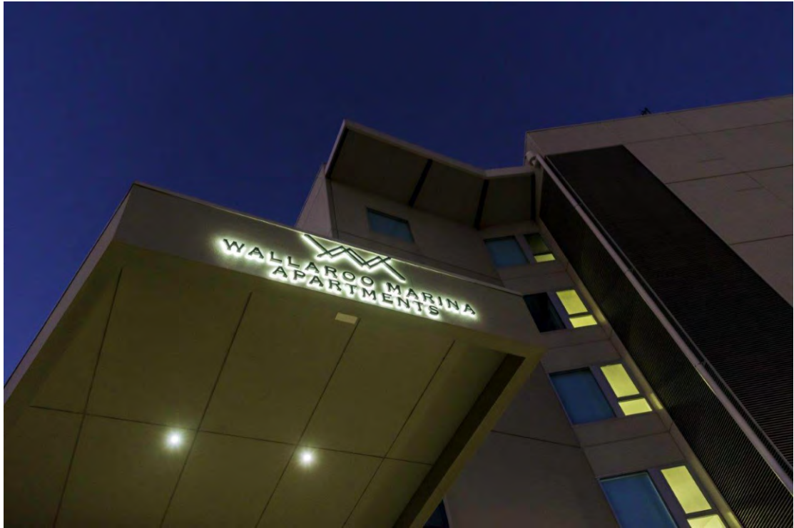
Fabricated backlit letters