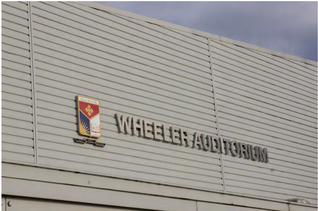
Fabricated stainless steel letters