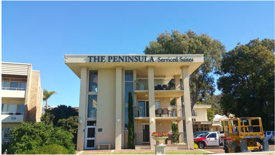
Front-lit letter with black/white acrylic face