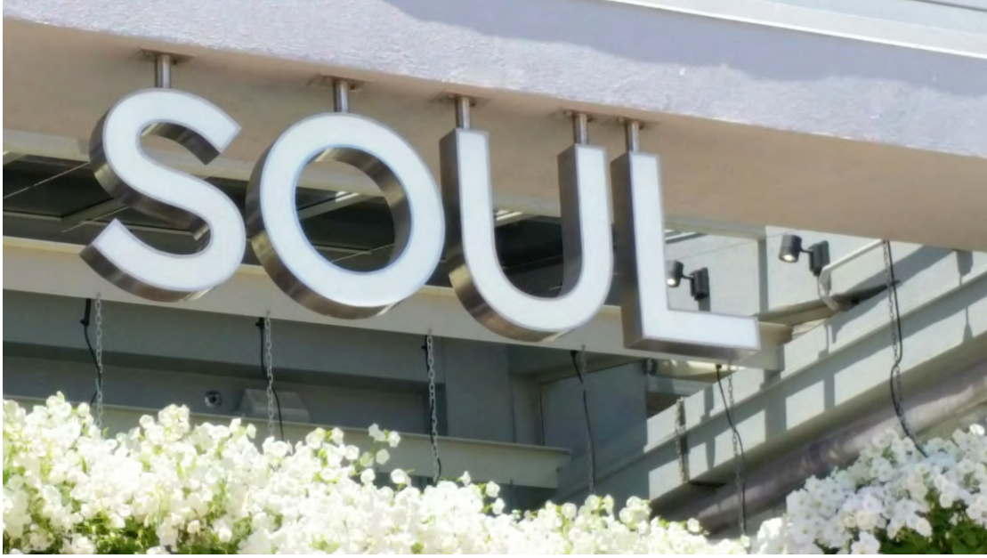
Front-lit letters with rimless face