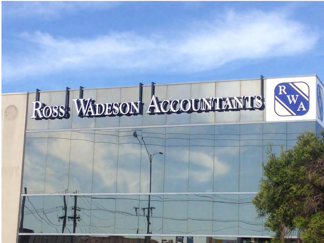
Fabricated front-lit letters