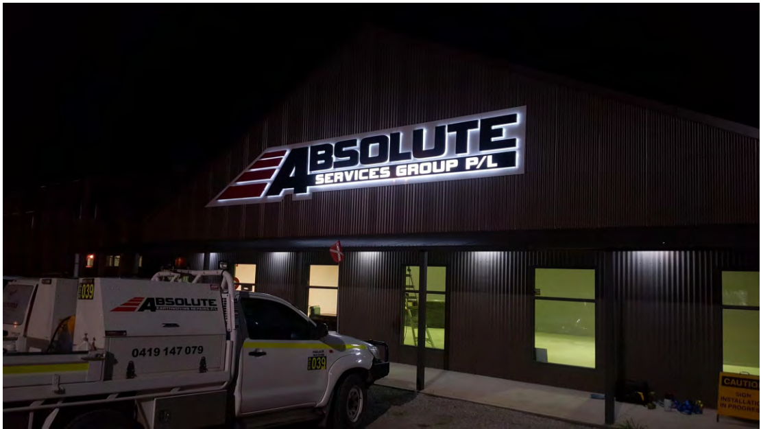
Backlit stainless steel fabricated letters