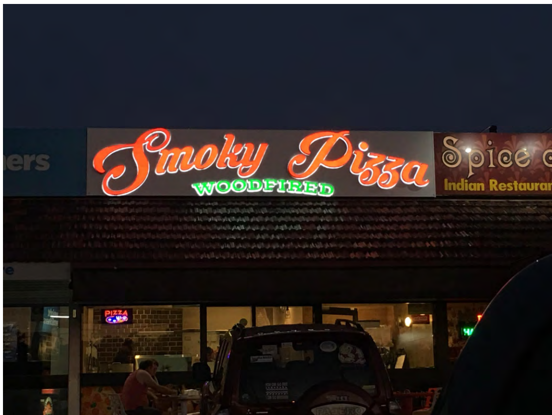
Front & back illuminated fabricated letters