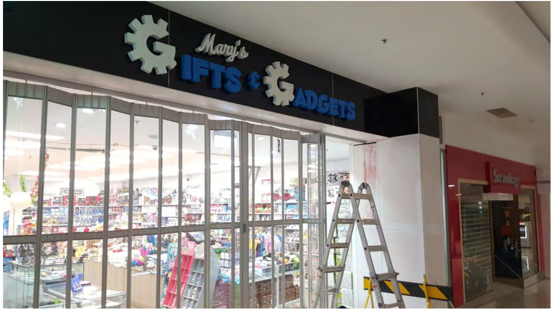
Fabricated backlit letters