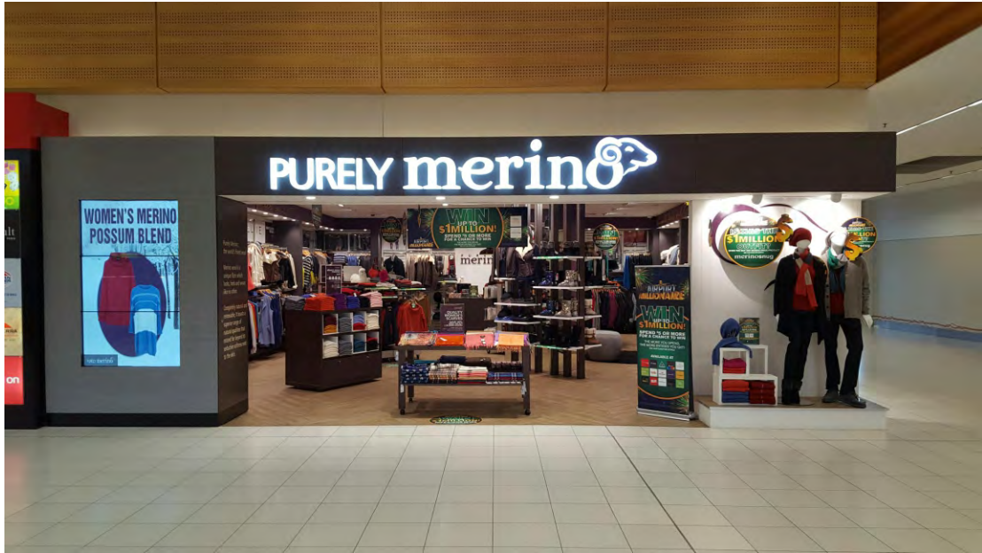
Illuminated acrylic fabricated letters