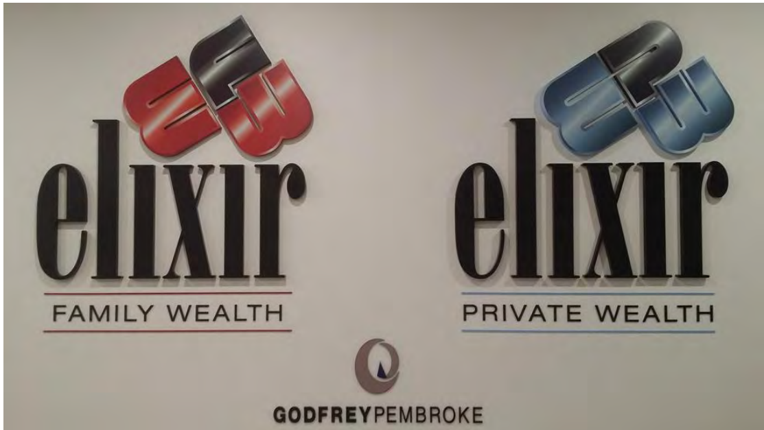
Fabricated stainless steel letters