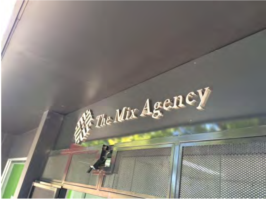
Gold electroplated letters