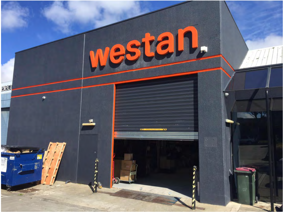
Stainless steel fabricated letters