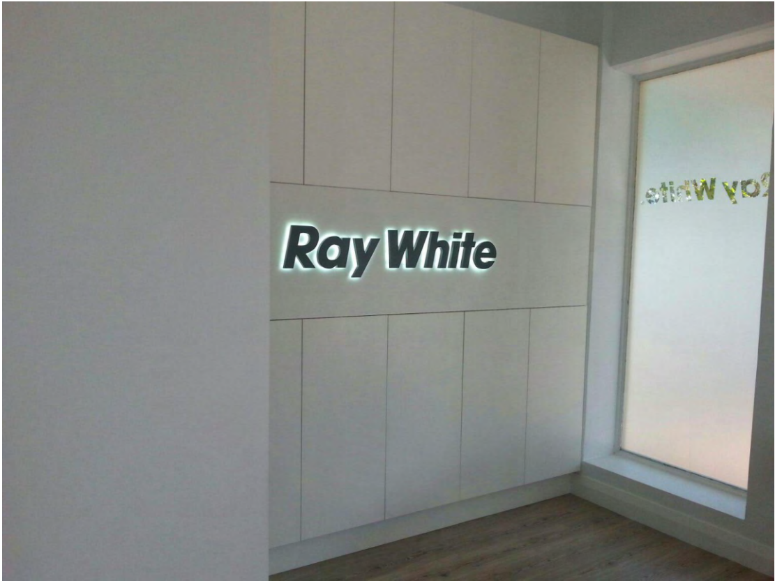
Fabricated backlit letters