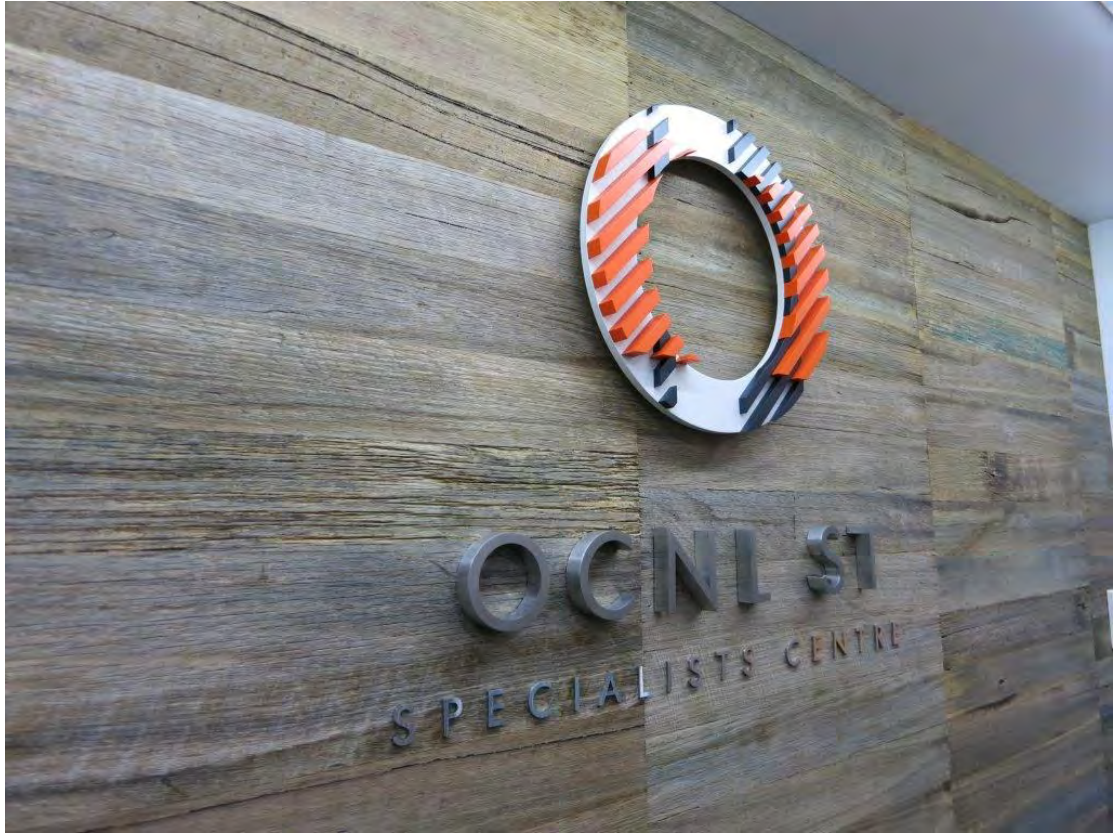
Fabricated stainless steel letters+laser cut letters