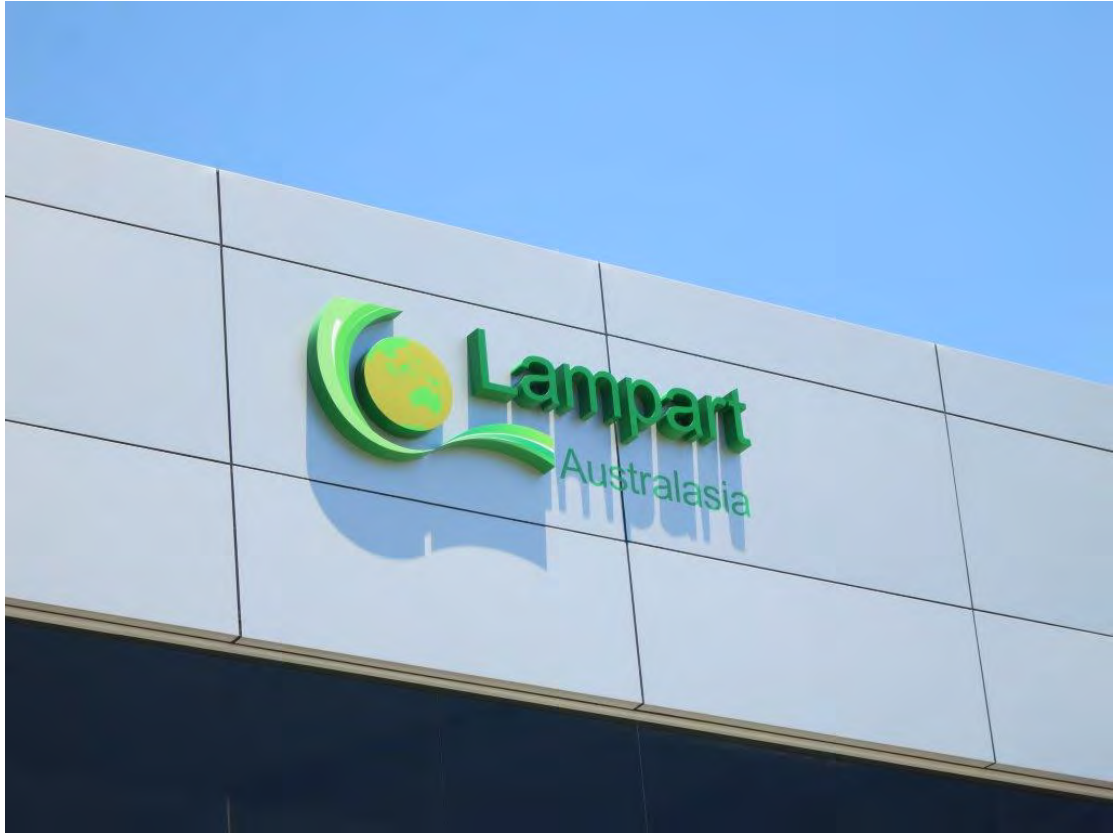
Fabricated stainless steel letters