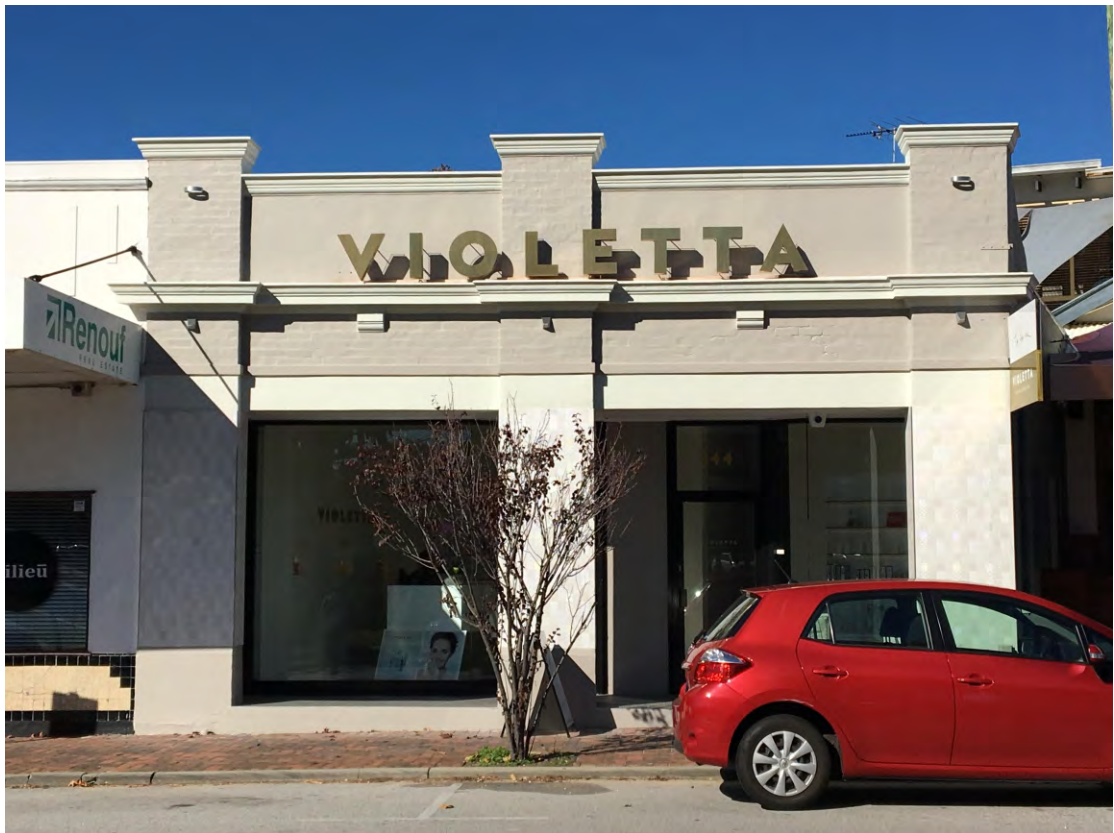
Backlit fabricated letters