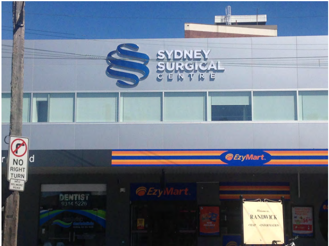
Front-lit fabricated letters