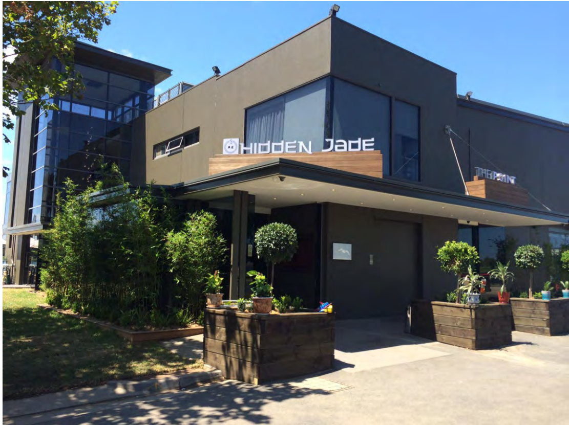
Fabricated front-lit letters