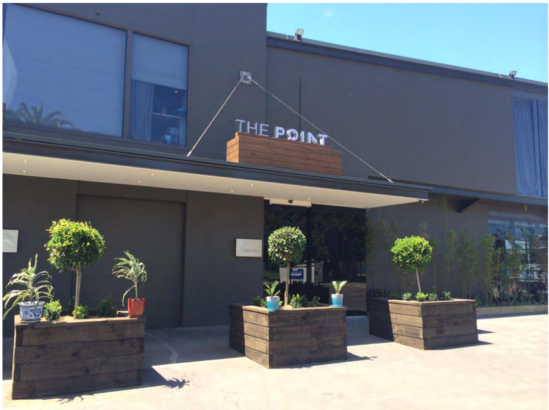
Fabricated front-lit letters