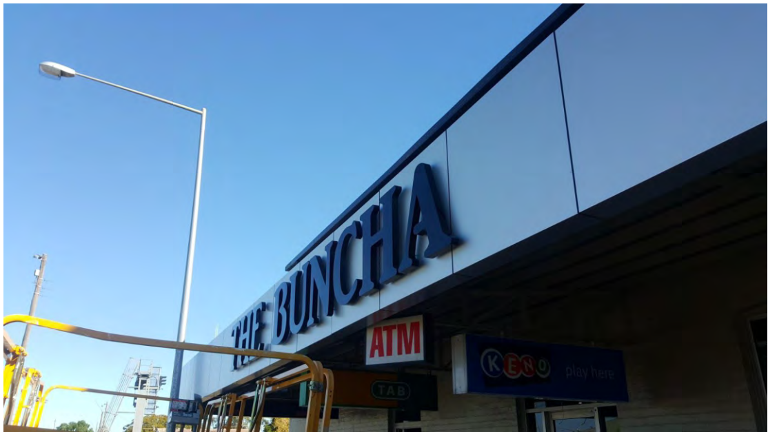
Fabricated backlit letters