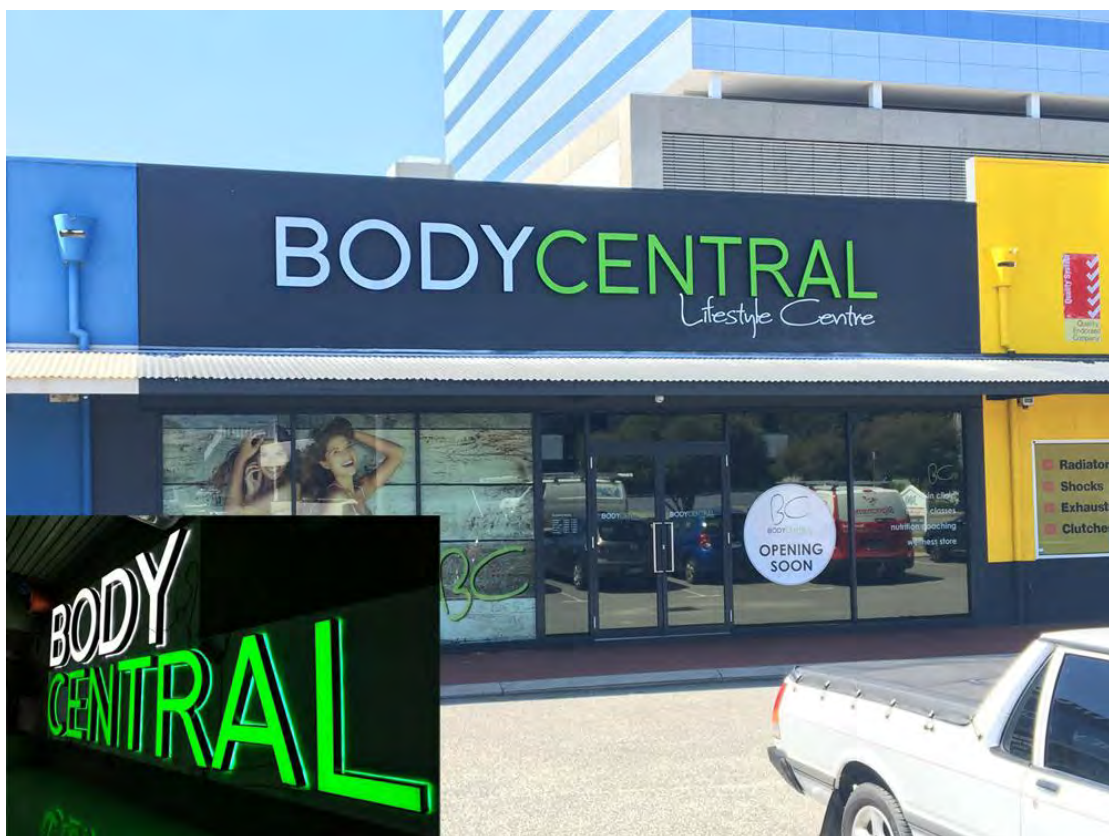
Front & back illuminated fabricated letters