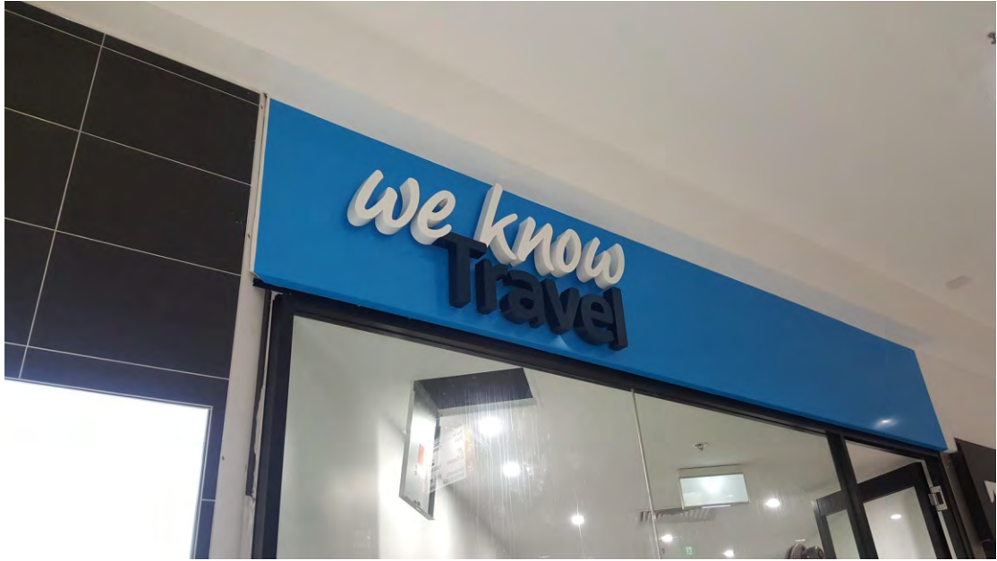
Fabricated backlit letters