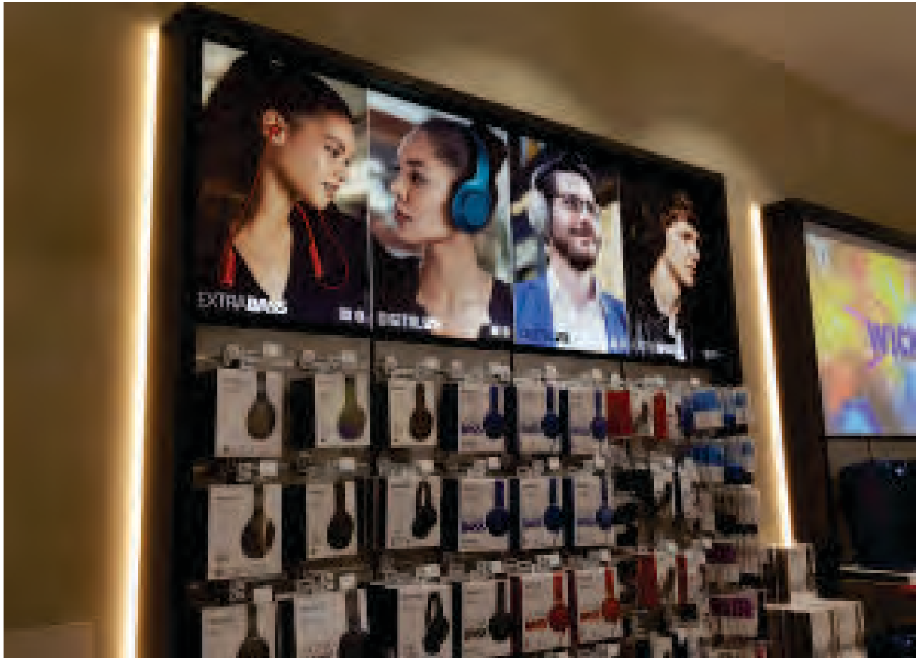
Sony Westfield Text Frame Light Box