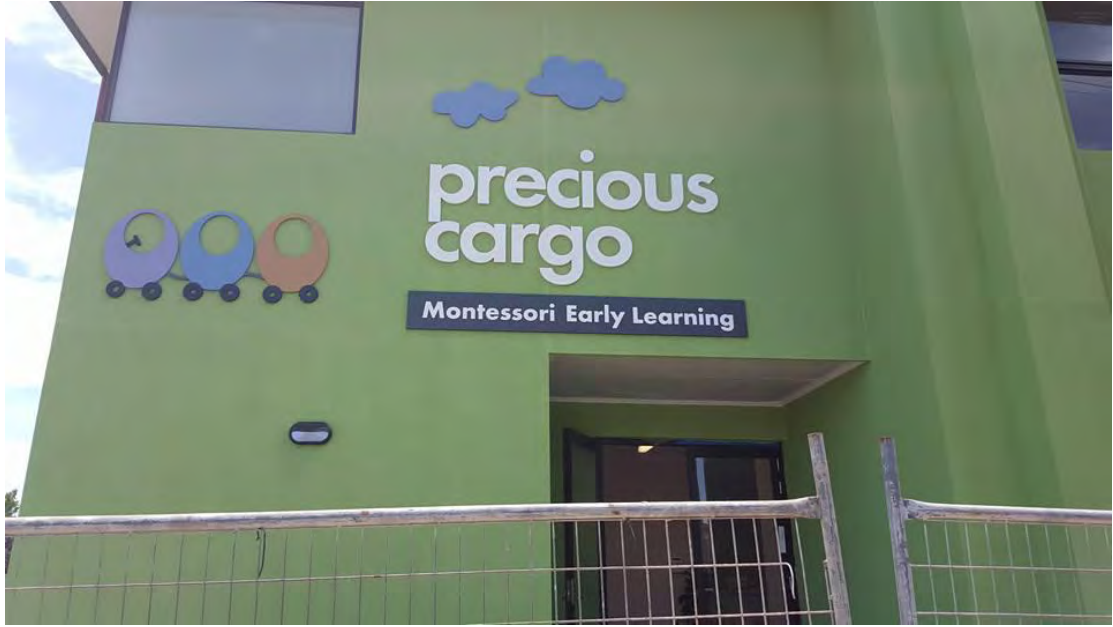
PVC cut-out letters