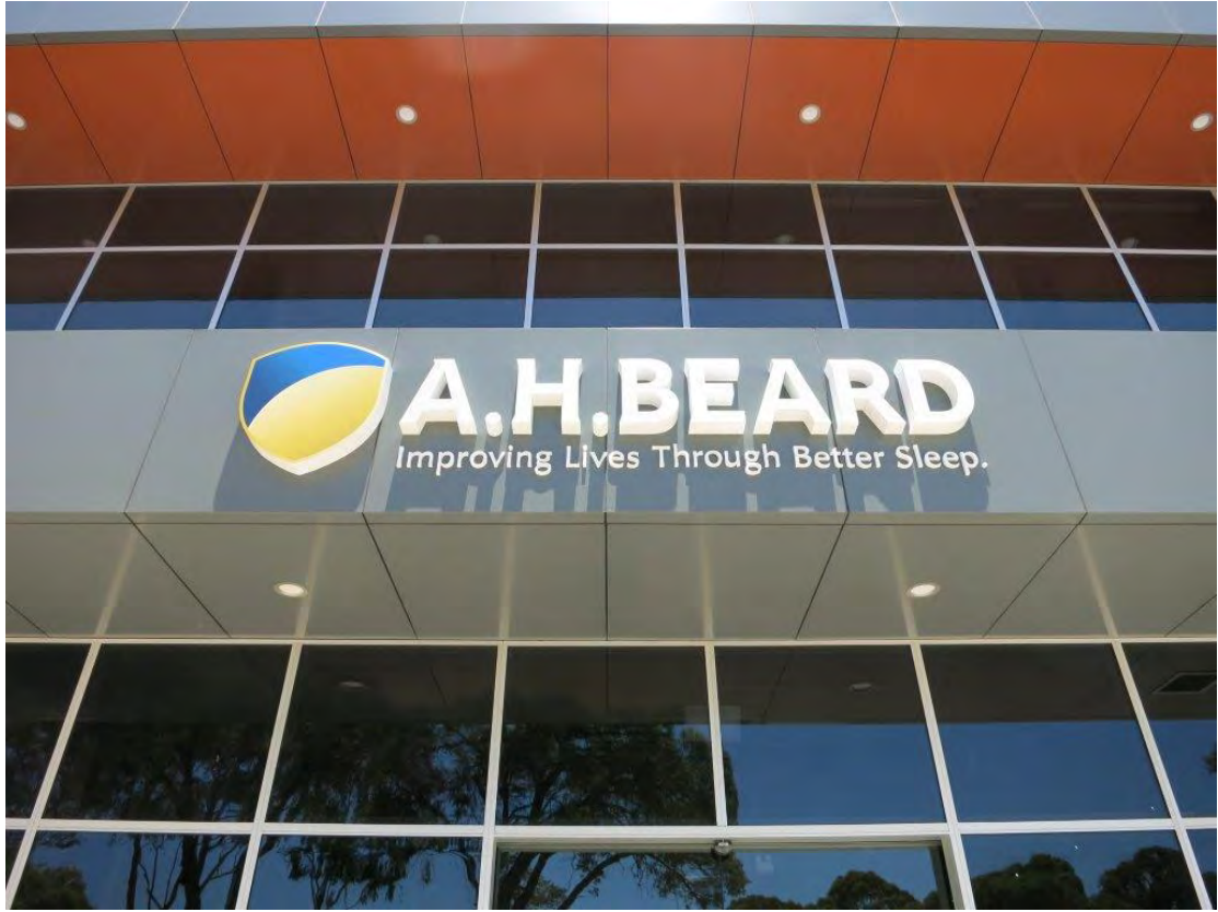
Fabricated stainless steel letters